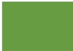
Brook Green [CR]